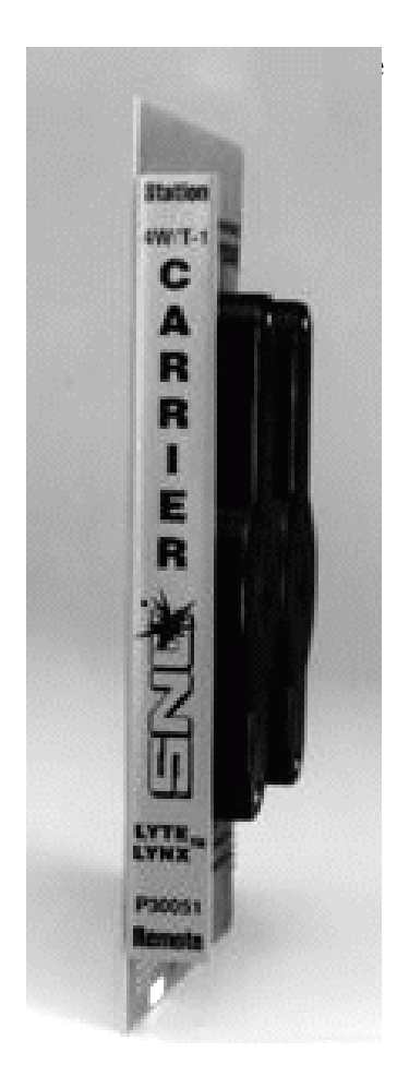
Figure 1: Photo of P30051 4-Wire DSI Isolation Card