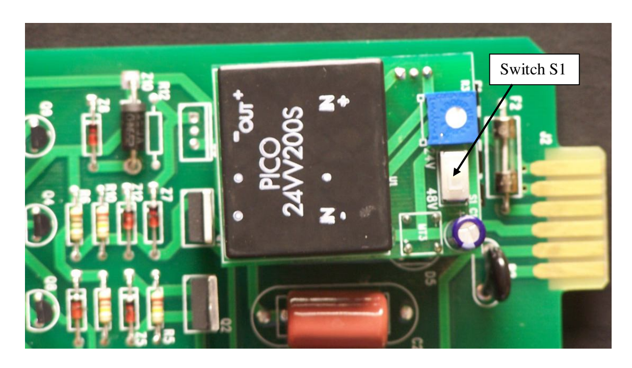
Figure 2: Station Side Circuitry- Showing Switch S1