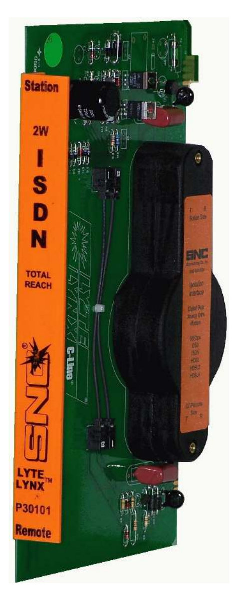
Figure 1: Photo of P30101 Total Reach ISDN Isolation Card