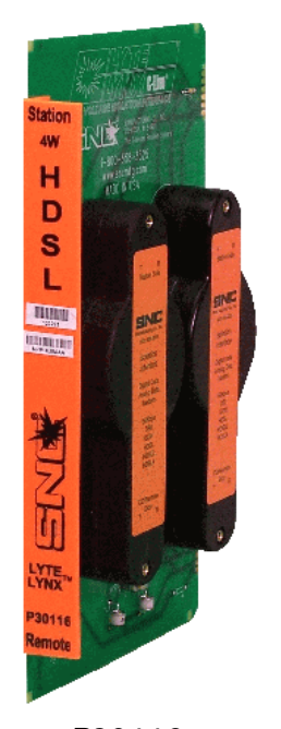
P30116 4-Wire HDSL2/56kbs Data Isolation Card