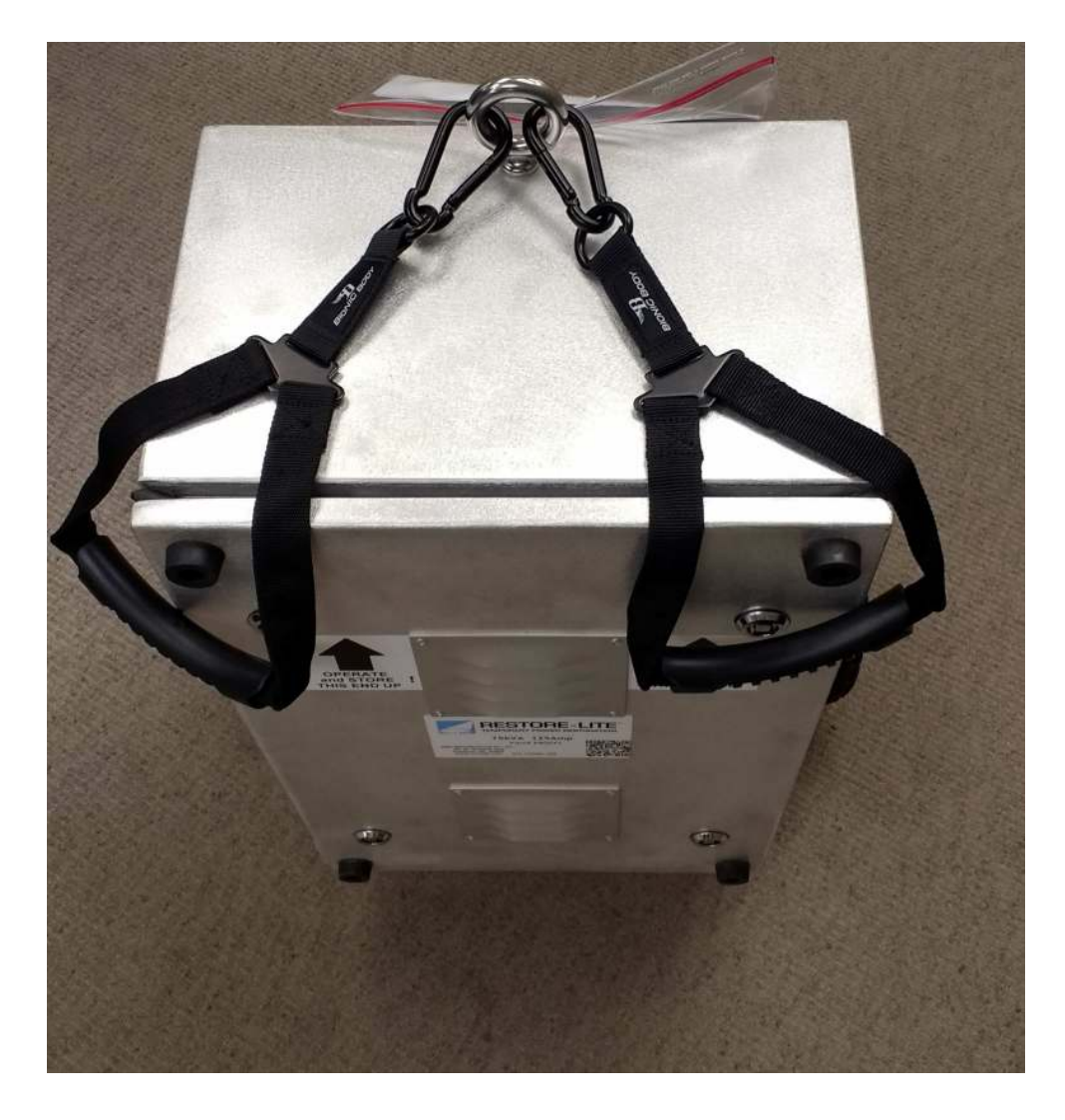
Handles attached and ready for lifting