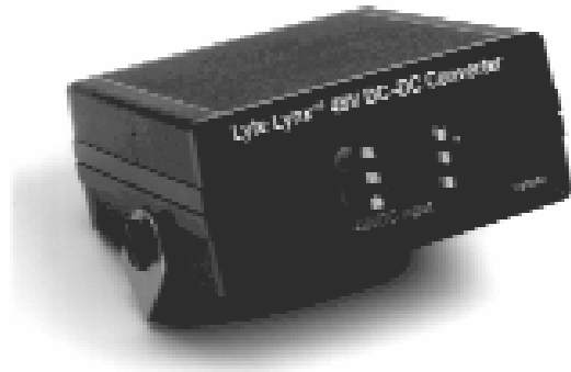
Figure 1: Power Supply with Mounting Bracket