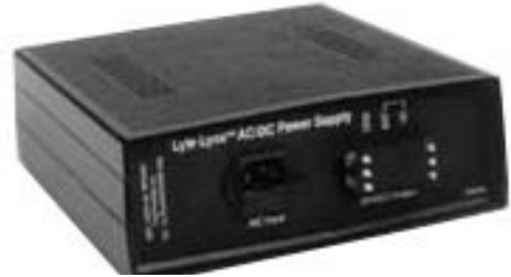
Figure 1: P30059

This document describes the technical specifications, technical requirements and installation instructions for the P30059, SNC Lyte Lynx® 120VAC/130VDC to 24VDC external power supply. It provides an understanding of the basic functions and features available with this product.