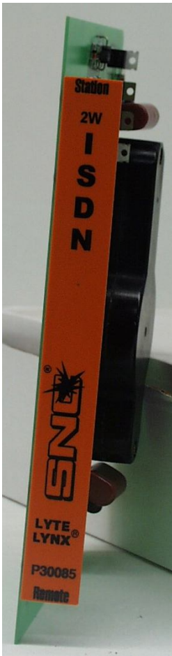
Figure 1: Photo of P30085 ISDN Isolation Card: -48VDC Input