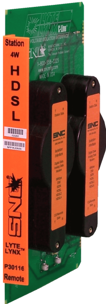
P30116 4-Wire HDSL2/56kbs Data Isolation Card